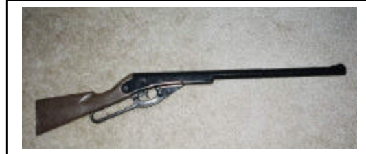
American Classic .177 BB/Pellet